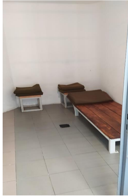
The building of the Tata Police Station and the preparation room

A report on the visit will be drawn up by the national preventive mechanism.