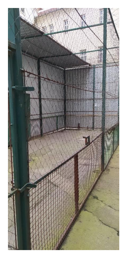
The chapel and one of the walking courtyards

The purpose of the visit was to examine the treatment of the detainee and the conditions of detention in winter weather conditions.