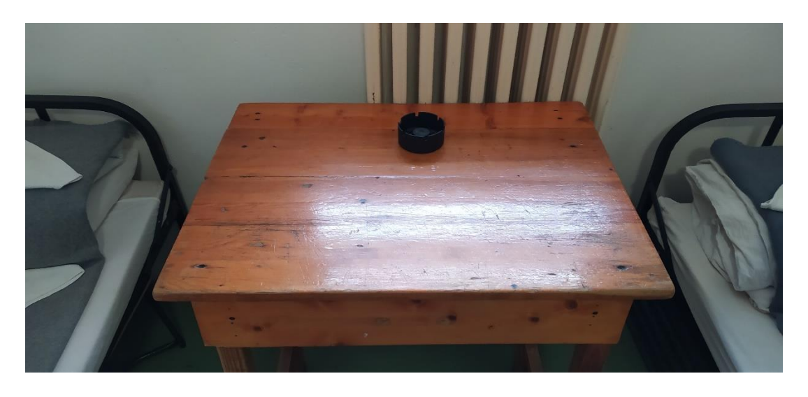
The table in a smoking cell