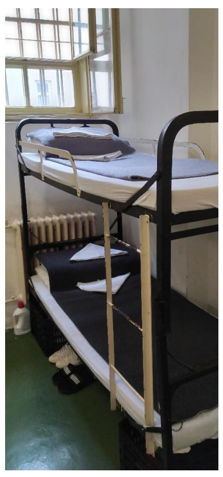
Beds in a double and a multi-person cell