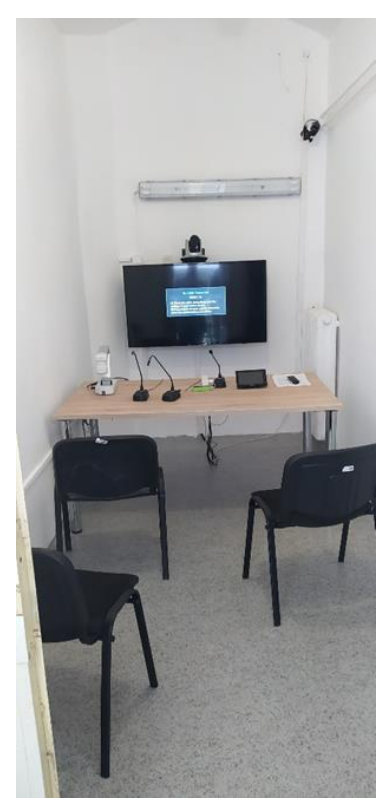
Laundry and teleconference room