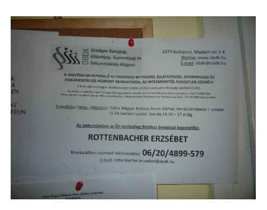
The patients are not allowed to leave Unit 'A' of the Department of Psychiatry, they cannot keep their mobile phones, so they cannot reach the patients' rights representative either, i.e. their right to complain is not ensured.

The staff members of the Department of Psychiatry were in compliance with the statutory requirements regarding the performance of their tasks. The patients were served by 5 specialist medical doctors, 2 resident medical doctors, 5 psychologists, 3 qualified social workers, 3 health care administrators and 38 nurses. There was only one nurse with a BSc degree at the Department of Psychiatry, and only one quarter of the rest of the staff held qualifications as psychiatric-mental health nurses. In order to preserve the physical and mental well-being of the employees, to reduce the risk of burnout, furthermore, to moderate the high rate of turnover, the management of the Hospital introduced a matrix-type work regime for the employees working at the individual departments, as well as relaxation opportunities, high-standard further training sessions and professional events.