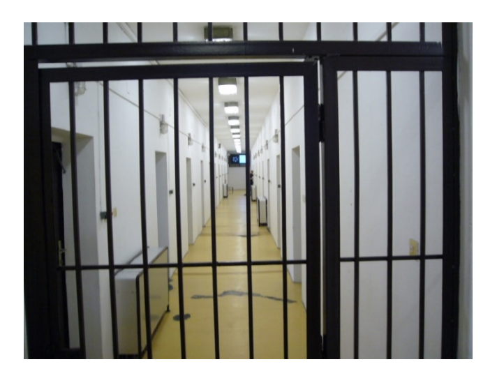
Corridor of the Holding Facility of the Nógrád County Police Headquarters

At the County Holding Facility, the "exercise areas" that were built for ensuring some fresh air time for the detainees were, in fact, closed wings of buildings on the floor of the holding facility where the windows had been replaced by bars. The size and design of these areas did not allow the detainees to exercise outdoors. The NPM asked the head of the Nógrád County Police Headquarters to take action for providing the detainees with an exercise area in the fresh air, which is to be ensured to the detainees by law.