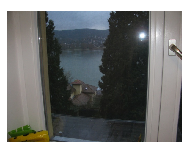
View of the River Danube at the Visegrad Aranykor Foundation Retirement Home

there is a beautiful view on the River Danube through the glass side wall. In the library behind the entrance hall, there is a television set, and comfortable armchairs next to the books. This room opens onto a bathroom and toilet for residents and a large community room. The majority of the residents' rooms were on the 2nd and 3rd floors of the building, with a view on the hills or the River Danube. Most of the residents lived alone or with one room-mate. There were only two rooms which had three residents each. Some of the rooms also had an own bathroom. The majority of the showers were in good condition.