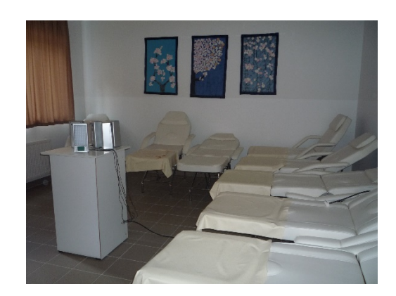
Relaxation room available for the patients and staff members at the Department of Psychiatry

The staff members of the Department of Psychiatry were in compliance with the statutory requirements regarding the performance of their tasks. The patients were served by 5 specialist medical doctors, 2 resident medical doctors, 5 psychologists, 3 qualified social workers, 3 health care administrators and 38 nurses. There was only one nurse with a BSc degree at the Department of Psychiatry, and only one quarter of the rest of the staff held qualifications as psychiatric-mental health nurses. In order to preserve the physical and mental well-being of the employees, to reduce the risk of burnout, furthermore, to moderate the high rate of turnover, the management of the Hospital introduced a matrix-type work regime for the employees working at the individual departments, as well as relaxation opportunities, high-standard further training sessions and professional events.