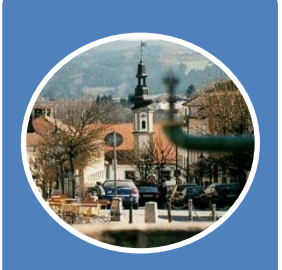
Cities, local communities