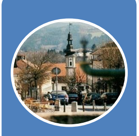
Cities, local communities